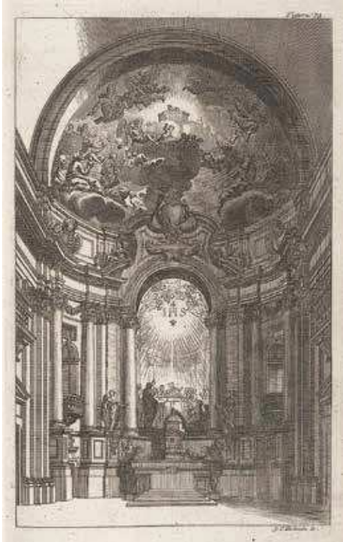
3 A. Pozzo, Figura LXXIII, Perspectivae pictorum atque architectorum , vol. II, Augsburg, 1709 ( http://digi.ub.uni-heidelberg.de )

opening up to reveal the Nativity scene with the Virgin Mary standing next to the kneeler and Archangel Gabriel hovering above her. 15 Ranger's treatment of the figure was not literal. Instead, he reduced the architectural elements to a certain degree and used a smaller number of sculptures. Still, Ranger undoubtedly drew on Pozzo for the altar, but also for other parts of the interior, which is evident in the chancel vault, where he modelled the dome on Pozzo's famous trompe-l'oeil dome in St Ignatius in Rome (1684 – 1685), published as Figure XCI in the first volume of the treatise. 16