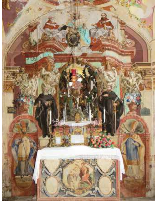
4 I. K. Ranger, Altar of St John the Baptist , 1731, chapel of St John the Baptist, Gorica near Lepoglava

Figure LXIV was also used by Pozzo to design the high altar of the Jesuit church of St Francis Xavier in Mondovì (1676 – 1679, present-day Chiesa della Missione ), 17 where the painted altarpiece provides a stage-like setting for various religious scenes, and in the Franciscan church of St Jerome in Vienna (1706/7). 18 These altar compositions demonstrate a fusion of different media and impressive scenographic effects with which Pozzo built a sort of macchina d'altare . In his explanation of the figure, Pozzo claimed that it was a suitable model for high altars, but that he himself frequently used it for theatrical scenes for the Forty Hours' Devotion. 19 It was a widely adopted form of altar that served as a model for numerous painted altarpieces in Central European churches between the 18 th and 20 th centuries. Some of them include (the former) St Catherine's Chapel in Wernberg Castle, Austria (1730 – 1735) by painter Josef Ferdinand Fromiller (Oberdrauburg, 1693 – Klagenfurt, 1760), 20 the altarpiece