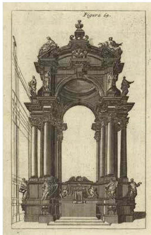
2 A. Pozzo, Figura LXIV , Perspectivae pictorum atque architectorum , vol. I, Augsburg, 1709 ( http://digi.ub.uni-heidelberg.de )

The corpus of Croatian illusionist altarpieces 10 shows an exceptionally wide range of quality in the treatment of illusionist painting and the manner in which illusionist scenes are brought into relationship with the architecture of the sacral buildings in which they are painted. Illusionist paintings feature carefully devised scenes containing the Baroque theatrum sacrum , whose central stage is formed by an altarpiece incorporated into an overall series of wall paintings in the chancel or the church interior as a whole. This type of painted scenes are discernible in the oeuvres