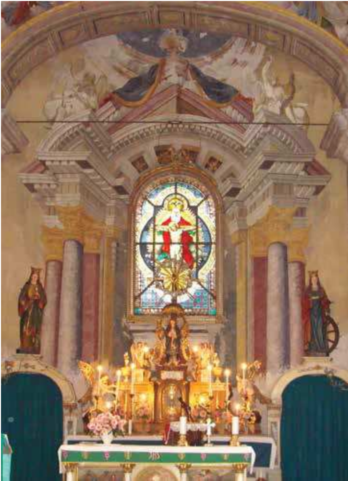
14 A. Archer and associates (attributed), painted altarpiece (high altar), 1793 (repainted in 1910), parish church of the Holy Trinity, Legrad

A. Archer i suradnici (pripisano), iluzionirani retabl glavnog oltara, 1793., (preslik 1910.), župna crkva Presvetog Trojstva, Legrad