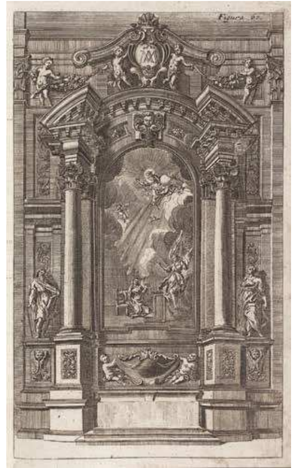
15 A. Pozzo, Figura LXXVII, Perspectivae pictorum atque architectorum , vol. II, Augsburg, 1709 ( http://digi.ub.uni-heidelberg.de )

A. Archer i suradnici (pripisano), iluzionirani retabl glavnog oltara, 1793., (preslik 1910.), župna crkva Presvetog Trojstva, Legrad