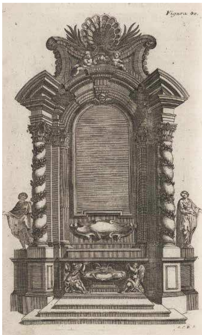
7 A. Pozzo, Figura LXXX, Perspectivae pictorum atque architectorum , vol. II, Augsburg, 1709 ( http://digi.ub.uni-heidelberg.de )