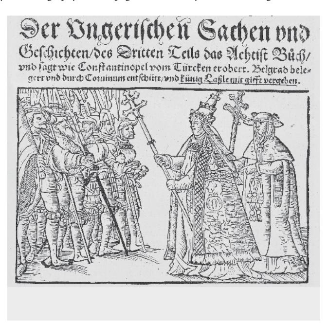
17. Pope Nicolaus V pronouncing remission of sins to soldiers, Bonfini, Des aller mechtigsten Künigreichs inn Ungern warhafftige Chronick und Anzeigung, Basel, 1545, Budapest, National Széchényi Library, App. H. 1734

Finally, we must consider the first known illustrated copy of Bonfini's Rerum ungaricarum decades , its 1545 Basel edition. It seems very likely that there was no previous tradition the illustrators of this book could follow. They were free to devise a completely new cycle of images, and they did a good job.