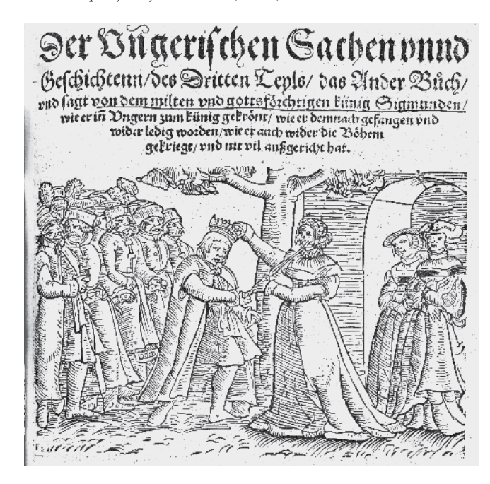
16. Queen Maria offers the royal insignia to King Sigismund, Bonfini, Des aller mechtigsten Künigreichs inn Ungern warhafftige Chronick und Anzeigung, Basel, 1545, Budapest, National Széchényi Library, App. H. 1734

Kraljica Marija pruža kraljevske insignije kralju Sigismundu, Bonfini , Des aller mechtigsten Künigreichs inn Ungern warhafftige Chronick und Anzeigung, Basel , 1545., Budimpešta , Nacionalna knjižnica Széchényi , App. H. 1734