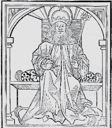
Ono Torun genuit Serebā michaelt. Abidbaelt vo genuit Calung Lavillaus Estaul. Sereba voolume pmonifotaculo. Almonitectucumationis nogenetimotectucumationis nogenetimotectucumationis nogenetimotectucumationis nogenetimotectucumationis nogenetimotectucumationis peter firebalt plumes quiec genuit filios: figureralio babuit vinifilia momine Emerici oco anabilese botibus bomotabile: cur'i memosa in beneticia ce cit: bic air pilemanble ciumi pilit piorini: rapruse efto emeoi me malicia mutareticellecticios e ne fictio occiperaniumi et quemao.

Degeneratióe rregnofanctiregis Stepbanipal miregisbungarox.