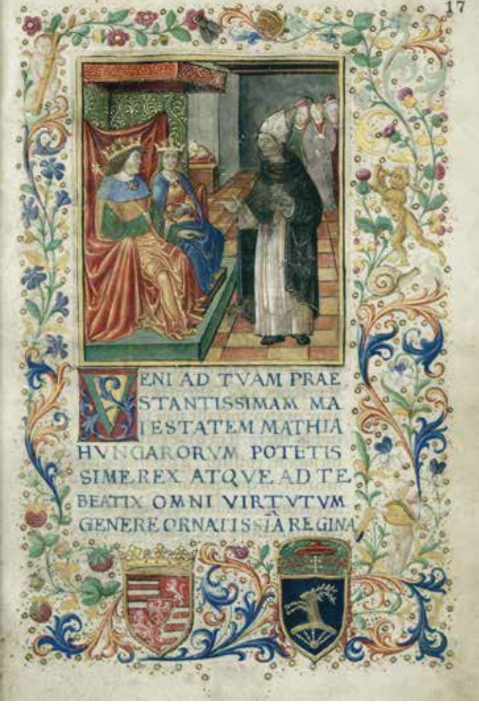
2. Ransano's speech before Matthias and Beatrix, Ransanus-corvina, Budapest, National Széchényi Library, Cod. Lat. 249, fol. 17r Ransanov govor pred Matijom i Beatrix, Ransanus-corvina, Budimpešta, Nacionalna knjižnica Széchényi, Cod. Lat. 249, fol. 17r

neither Johannes Corvinus nor Queen Beatrix succeeded in their ambitions. It was not the Habsburgs who gained power either. Instead, Ladislaus of the House of Jagiellon (†1516) was elected and crowned King of Hungary.<sup>7</sup>