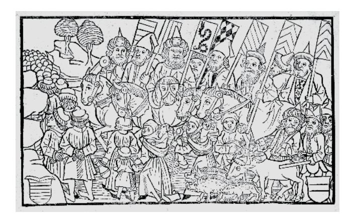
3. Conquest of the Carpathian Basin, Johannes de Thurocz, Chronica Hungarorum, Brno, 1488, Budapest, National Széchényi Library, Inc. 668

Osvajanje Karpatskog bazena, Johannes de Thurocz , Chronica Hungarorum, Brno , 1488., Budimpešta , Nacionalna knjižnica Széchényi , Inc. 668