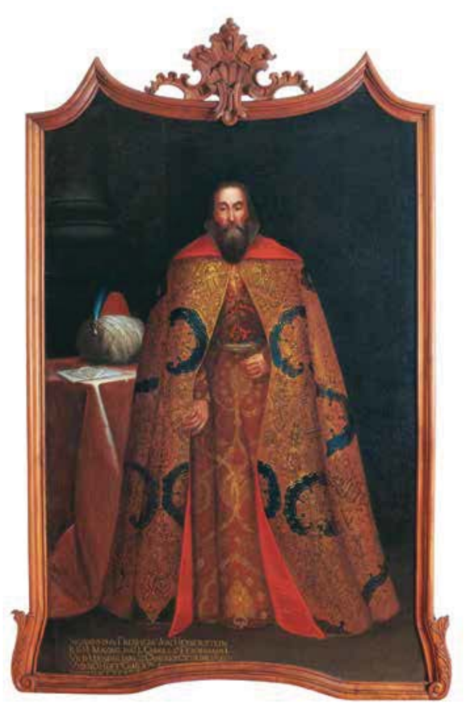
7. Unknown artist, Sigismund Baron Herberstein , Regional Museum Ptuj-Ormož

When two of Herberstein's 'loving descendants', whose identities have yet to be determined, but presumably both living in the 18<sup>th</sup> century, selected the model for the portraits of Sigismund Herberstein intended for the family portrait galleries in Herberstein and Hrastovec castles and now preserved in Herberstein and Ptuj castles, both of them selected the depiction of Sigismund in the Turkish caftan. The unknown painters used coloured woodcuts as models but copied the details with a differing degree of accuracy. On the portrait in Herberstein Castle, Sigismund's figure occupies the whole painted surface. The painter added the Herberstein coat of arms in the lower right corner as well as a window in the upper corner, using its shelf as a pedestal for a turban. The patterns of silk velvet only approximately follow the woodcut, whereas in the Ptuj portrait, the painter copied every detail (Fig. 7). He added a column and a table