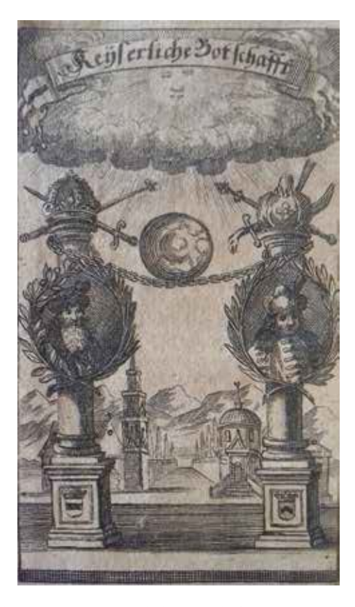
13. Unknown artist, Kaÿserliche Botschaft, engraving, in: Keiserliche Botschaft an die Ottomanische Pforte , 1672, Vienna, Austrian National Library

Neznani umjetnik, Carsko poslanstvo, bakrorez, u: Keiserliche Botschafft an die Ottomanische Pforte, 1672., Beč, Austrijska nacionalna biblioteka