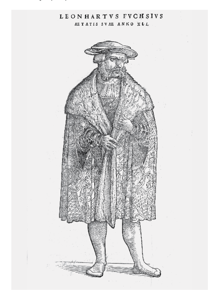
6. Veit Rudolph Specklin after Albrecht Meyer, Leonhard Fuchs , woodcut, in: Historia Stirpium , 1542

Veit Rudolph Specklin prema Albrechtu Meyeru, Leonhard Fuchs, drvorez, u: Historia Stirpium, 1542.