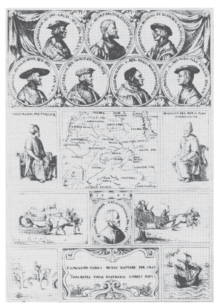
3. Augustin Hirschvogel, Map of Eastern Europe , 1547 Augustin Hirschvogel , zemljovid istočne Europe, 1547.

the portraits with his monogram.<sup>16</sup> However, Herberstein appears to have been dissatisfied with these depictions, probably because of the somewhat imaginative or eccentric appearance of the monarchs.<sup>17</sup> Two years later, Hirschvogel produced another seven etchings, this time in traditional medallion form reminiscent of portrait medals (Fig. 4).<sup>18</sup> The second series came closer to Herberstein's documentary expectations, illustrating several editions of Herberstein's books either in their original form or in woodcut copies.<sup>19</sup>