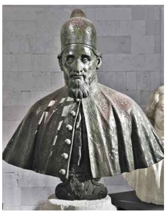
2. Workshop of Giulio del Moro, Doge Nicolò Donà , 1620, Regional Museum, Koper Radionica Giulia del Mora , Dužd Nicolò Donà, 1620., Pokrajinski Muzej, Koper

with an erased commemorative inscription, coat of arms and above it an empty round niche. A portrait bust of an unknown 17th century provveditore once stood inside. In the spring of 2019, during the archaeological excavations of the 15th-century All Saints Tower (Torrione Cappello) in the town of Korčula, two unknown stone busts emerged. The head of one of the statues has not been preserved, and the second statue has a disfigured face under a pompous late 17th-century wig and a richly decorated Venetian stole across the torso (Fig. 1). It is possible that this bust represents Marco Lippomano, who served as the rector of Korčula from 1681 until 1683. According to Giovanni Zorzi, the rector Lippomano's statue once stood inside the niche on the town walls near the maritime gate (Porta Marina) of Korčula.