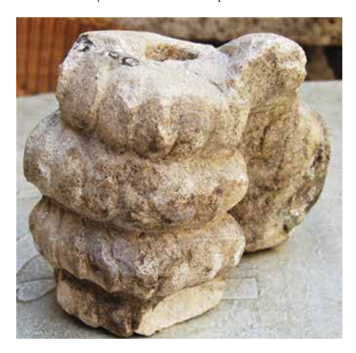
5. Original right fist of the Foscolo statue owned by the Arneri family, Korčula Izvorna desna šaka Foscolovog kipa u posjedu obitelji Arneri, Korčula

Architectonic composition and decoration of tomb monuments in Dalmatia and Istria changed during the second half of the 17th century. High-quality marble replaced the stone that had for centuries served as the basic material for local sculptors. Eastern Adriatic commissioners now began ordering designs, marble sculptures and portrait busts directly from Venice. High-quality sculpture was being shipped from the Venetian Lagoon and placed in Dalmatian and Istrian churches.