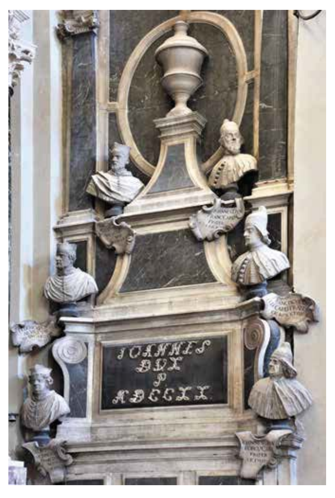
13. Monument to the Cornaro Family, 1720, San Nicolò dei Tolentini, Spomenik obitelji Cornaro, 1720., San Nicolò dei Tolentini, Venecija