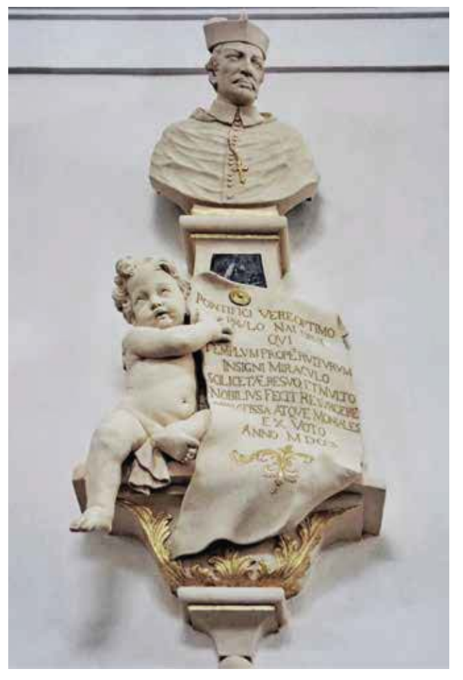
14. Monument to the bishop Paolo Naldini, 1702, Church of St Blaise, Koper

Spomenik biskupu Paolu Naldiniju, 1702., Sveti Blaž, Kopar