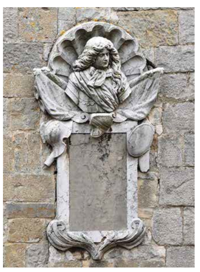
10. Monument to Antonio Bollani, 1688, Parish Church, Labin Spomenik Antoniju Bollaniju, 1688., župna crkva, Labin

and Venetian senator, Antonio Bollani (Fig. 10).38 Since 1688, the monument has been situated on the facade of the parish church in Labin. During restoration work in the mid-19th century, many inscriptions, coats of arms and even the Saint Mark's lion were placed on the façade. The original position of the Bollani monument on the façade of the parish church is confirmed by the notes written by Bartolomeo Giorgini, a local physician.<sup>39</sup> In 1731, he wrote that the City Council placed the monument on the façade of the church because they wanted to celebrate the hero Bollani, whose mother, Bianca De Negri, was from an old noble family from Labin. The monument has the typical form of a commemorative military monument with a portrait bust. On the black marble slab, we can read about Bollani's great achievements. In 1686, immediately after the liberation of the fortress of Sinj from the Ottomans, he repaired the fortress walls and led an army against the Ottomans in the district of Zadar. 40 Later, he became a Venetian senator. His portrait bust in armour was probably made by the Venetian sculptor Paolo Callalo.41 By building this monument to the still-living hero, the town of Labin wanted to show its connections with a celebrated person, originally from this small but important Istrian town.