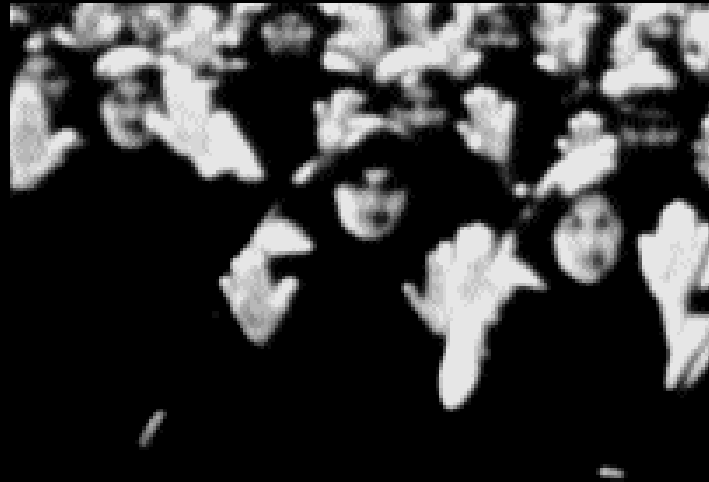
sl.2: S. Neshat, Possessed , 1998. sl.3: S. Neshat, Turbulent , 1998. sl.4: S. Neshat, Rapture , 1999. sl.5: S. Neshat, Turbulent , 1998. sl.6: S. Neshat, Untitled (Rapture series - Women with Boat) , 1999.