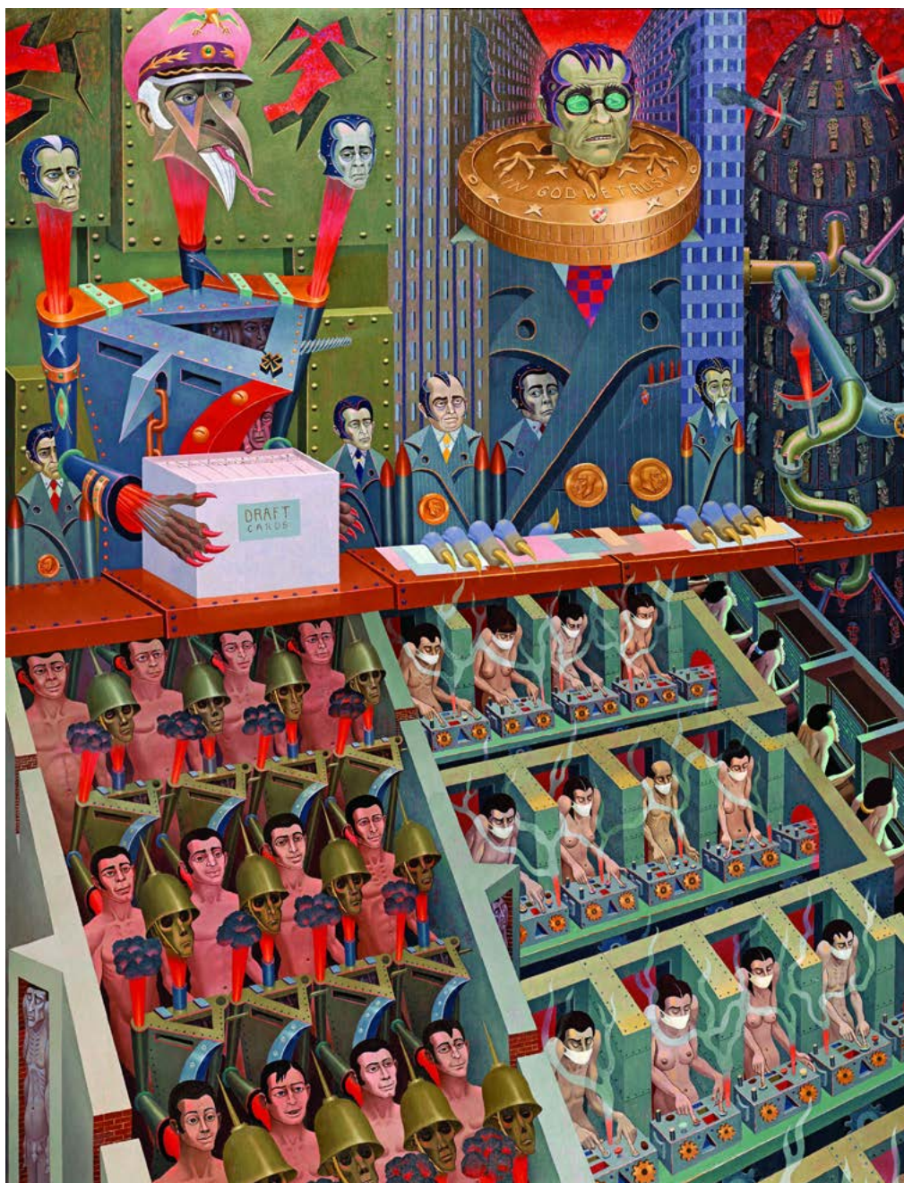
Irving Norman (1906–1989), M.F.I. Complex , 1981. Ulje na platnu, 254 × 193 cm / Irving Norman (1906–1989), M.F.I. Complex , 1981. Oil on canvas, 254 × 193 cm