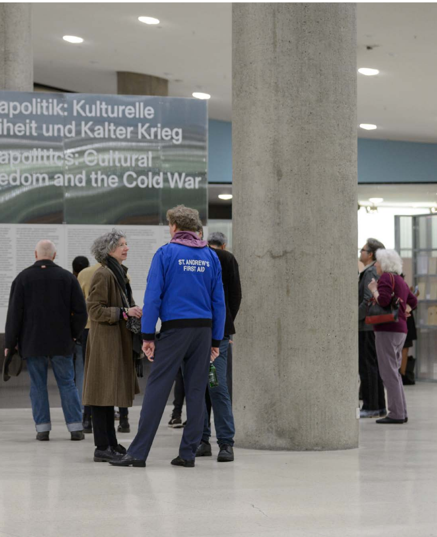
Parapolitics: Cultural Freedom and the Cold War  ↑