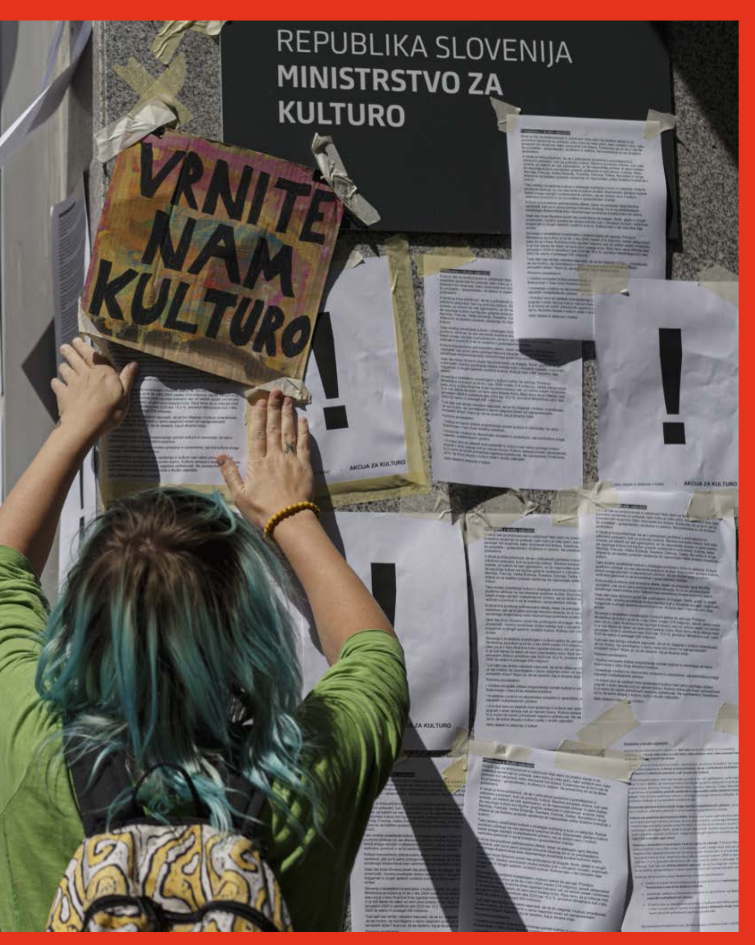
Fig. 7 ADDK, 1. akcija za kulturo [First Culture Action], protest gathering / protestno okupljanje, May 26, 2020 / 26. svibnja 2020., Ljubljana. ↑