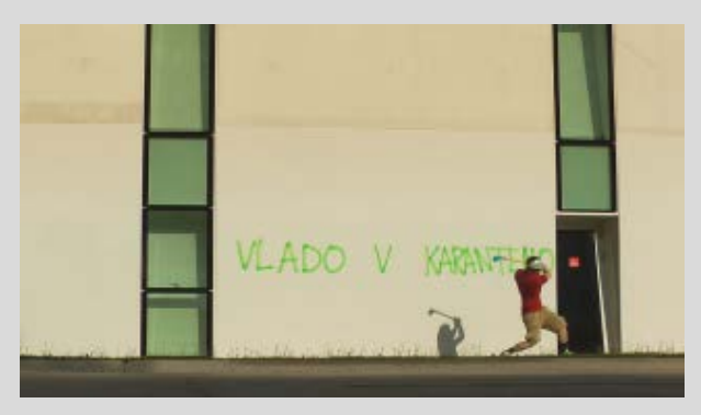
Fig. 5 Jaša Jenull, Dovoljena rekreacija... [Permitted Recreation], video still / video still, April 18, 2020 / 18. travnja 2020., Ljubljana.