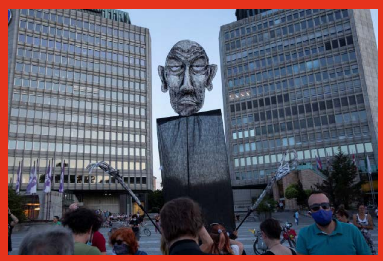
Fig. 24 Brane Solce, Janez Janša , protest gathering / protestno okupljanje, July 10, 2020 / 10. srpnja 2020., Ljubljana.