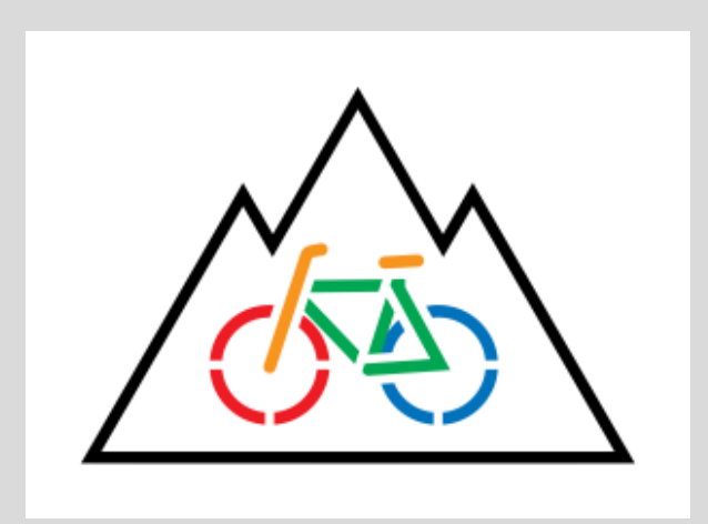
Fig. 17 : Ištvan Išt Huzjan, Untitled / Bez naslova, July 17, 2020 / 17. srpnja 2020.