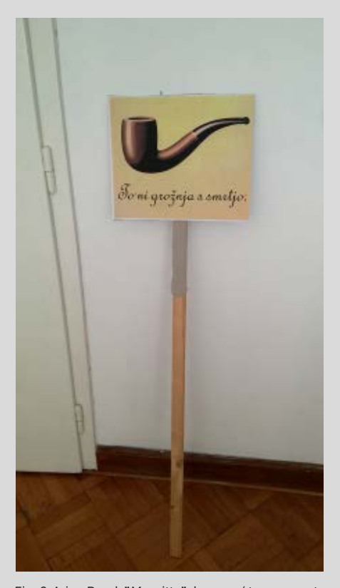
Fig. 6 Arjan Pregl, "Magritte", banner / transparent, June 19, 2020 / 19. lipnja 2020.

EUNIC Global 2020, »How is the European cultural sector responding to the current corona crisis? \alpha .