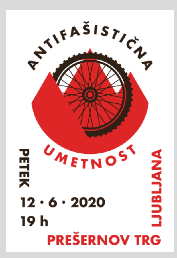
Fig. 14 lštvan lšt Huzjan, Antifašistična umetnost [Antifaschist Art], sticker / naljepnica, June 9, 2020 / 9. lipnja 2020.