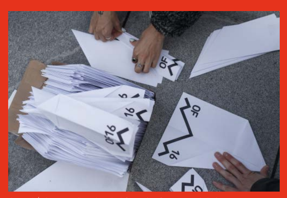
Fig. 13 Vuk Ćosić, Irena Woelle, Papirnata letala [Paper Planes], June 6, 2020 /6. lipnja 2020.