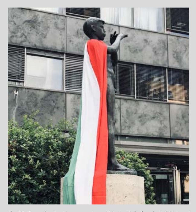
Fig. 21 Statue by the Slovene sculptor Zdenko Kalin (symbol of National Radio and Television with a Hungarian flag), intervention / Skulptura Zdenka Kalina (alegorija nacionalnog radija i televizije), intervencija. July 15, 2020 / 15. srpnja 2020., Ljubljana.

28 Online shaming is a form of public shaming in which targets are publicly humiliated on the internet, via social media platforms or other media.