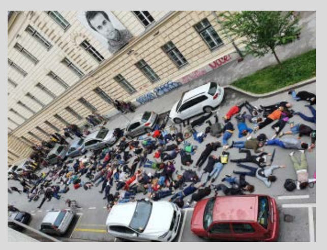
Fig. 8 ADDK, Poslednja akcija za kulturo [The last Action for Culture], protest gathering gathering / protestno okupljanje, June 9, 2020 / 9. lipnja 2020., Ljubljana.