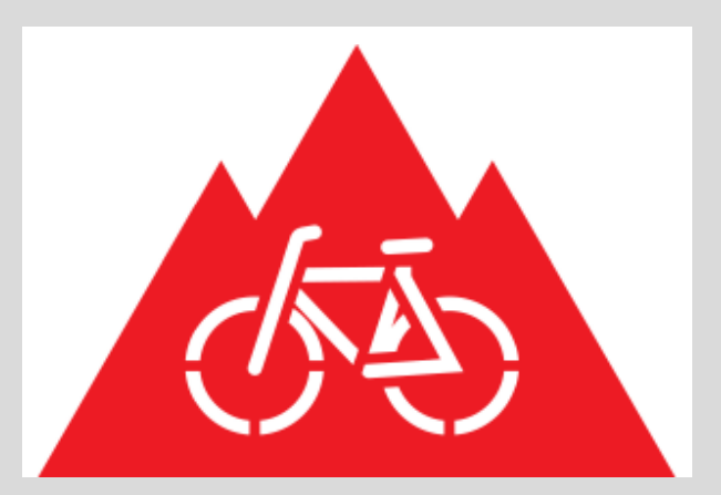
Fig. 3 Ištvan Išt Huzjan, Simbol vstaje [Symbol of Uprising], logo / logotip, May 15, 2020. / 15. svibnja 2020.