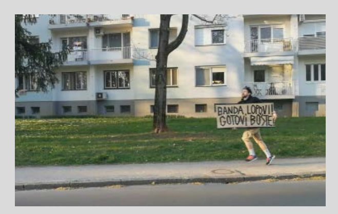
Fig. 4 Jaša Jenull, Rekreacija v času Janše in Koronavirusa [Recreation in the Time of Janša and the Corona Virus], video still / video still, March 20, 2020 / 20. ožujka 2020., Ljubljana.

ARTISTS AND CULTURAL WORKERS TRY TO FORM A DIALOGUE