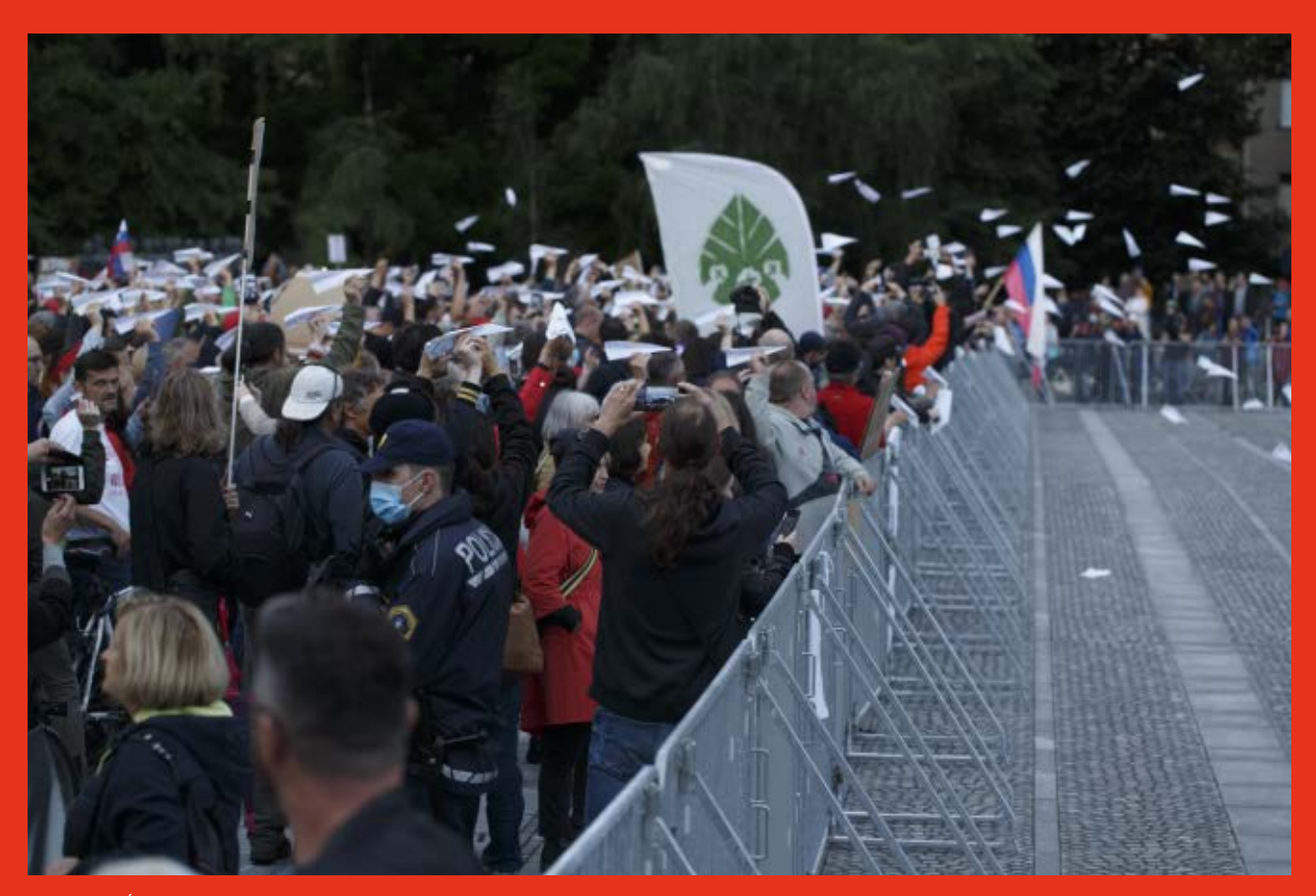
Fig.12 Vuk Ćosić and Irena Woelle, Papirnata letala [Paper Planes], protest gathering / protestno okupljanje, June 6, 2020 / 6. lipnja 2020., Ljubljana.