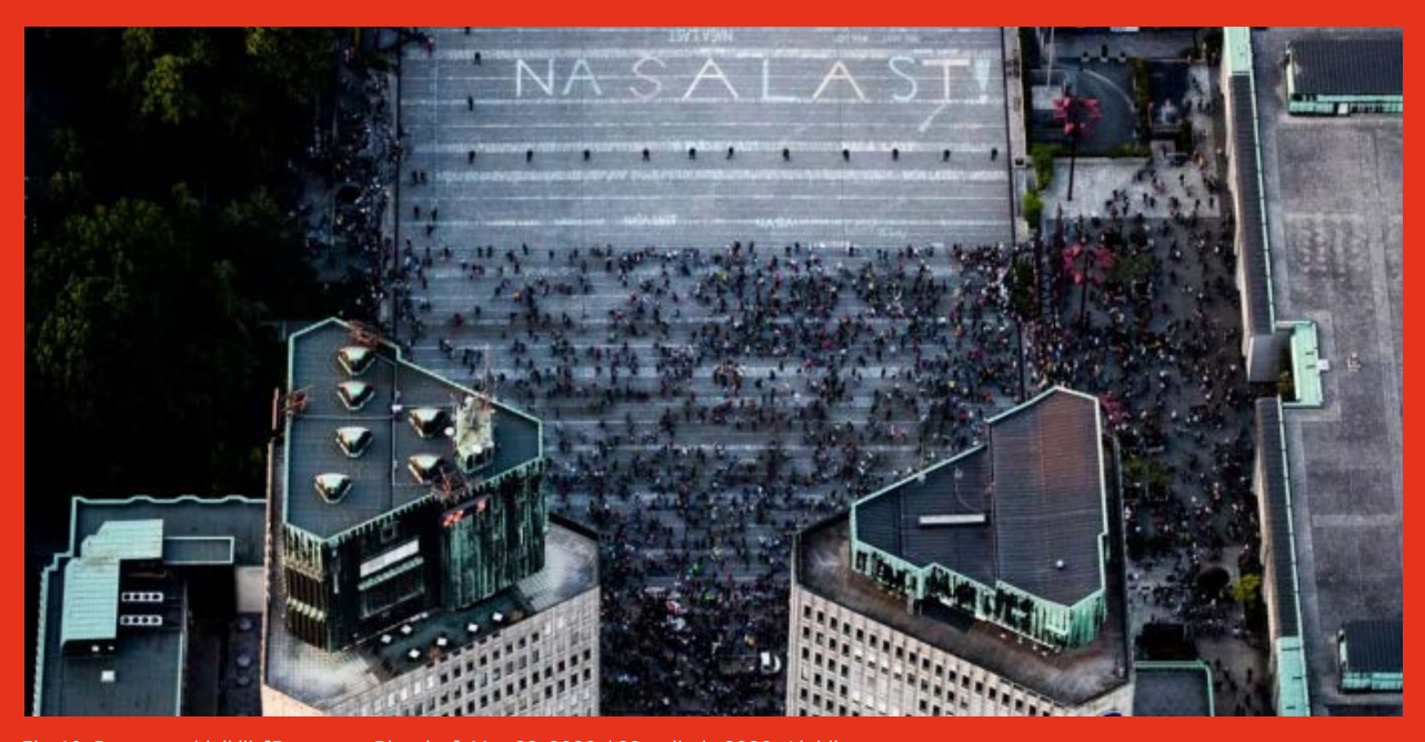
Fig. 16 Protest na biciklih [Protest on Bicycles], May 22, 2020 / 22. svibnja 2020., Ljubljana.