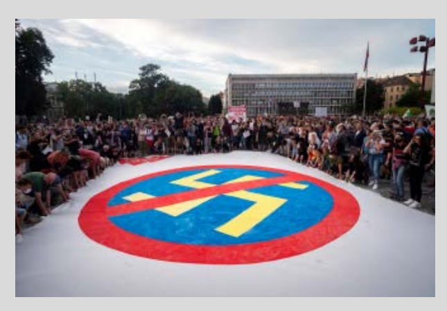
Fig. 10 \, ADDK, Untitled, flag / zastava, July 3, 2020 / 3. srpnja 2020., Ljubljana.

of Cultural Workers (Aktiv kulturnih delavk in delavcev) or ADDK for short.<sup>24</sup>