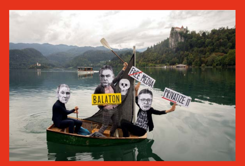
Fig. 23 Brane Solce et al, Untitled (Balaton), protest gathering / protestno okupljanja, August 31, 2020 / 31. Kolovoza 2020., Bled.