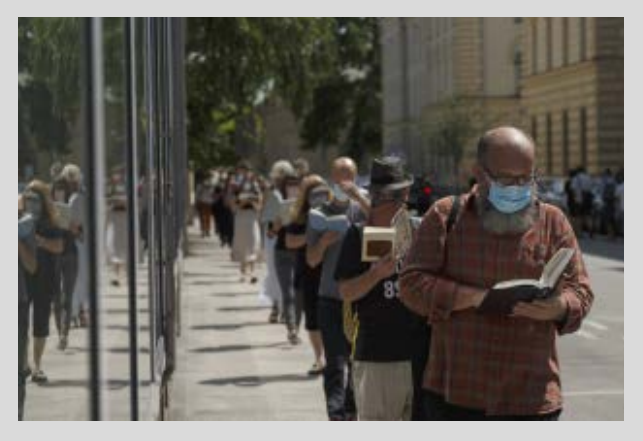
Fig. 9 ADDK, 5. akcija za kulturo: Utrjevanje snovi [Action for Culture 5: Repetition of Learned Matter], protest gathering / protestno okupljanje, June 30, 2020 / 30. lipnja 2020., Ljubljana.