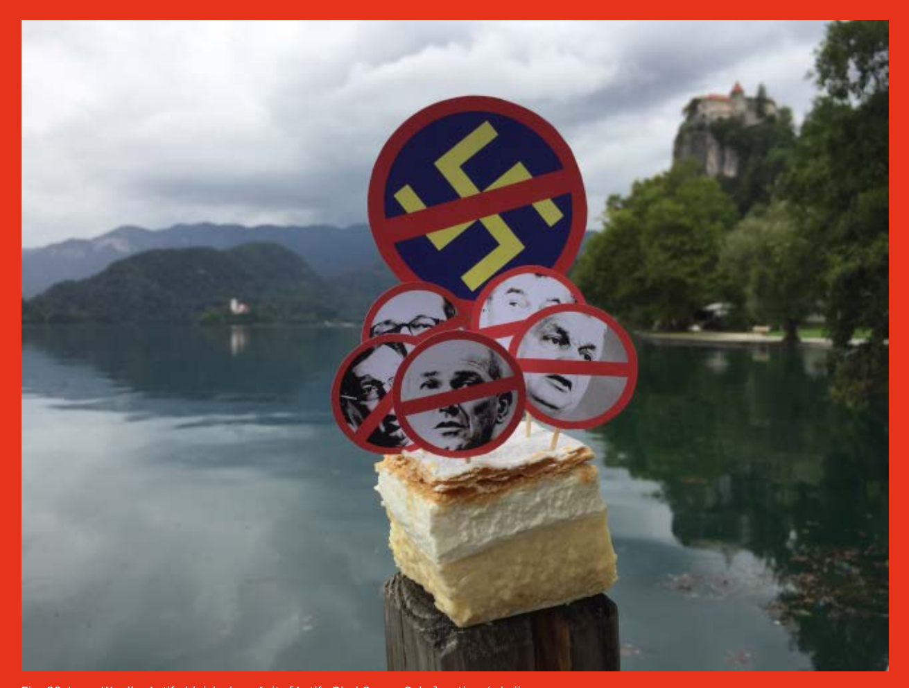
Fig. 22 Irena Woelle, Antifa blejska kremšnita [Antifa Bled Cream Cake], action / akcija, August 31, 2020 / 31. kolovoza 2020., Bled.