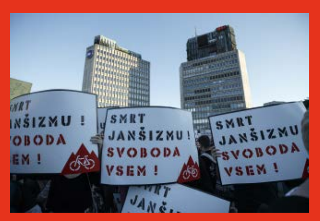
Fig.14 ADDK, Smrt janšizmu, svoboda vsem! [Death to Janshism, Freedom to All!], protest gathering / protestno okupljanje, June 12, 2020 / 12. lipnja 2020., Ljubljana.